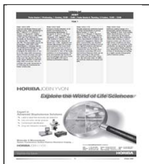
Example: 1/2 page ad b/w